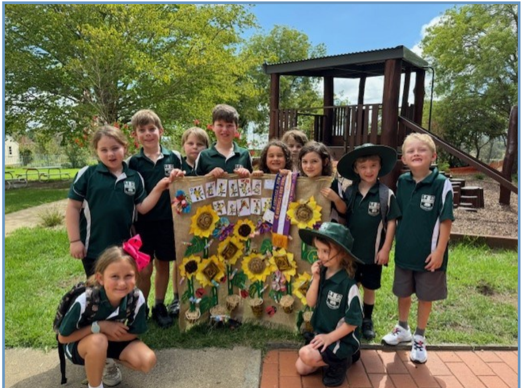
Upper Division were placed 3rd in the Years 3 - 6 Section - School Entry