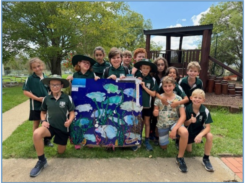
Lower Division were winners in the K-2 Section - School Entry