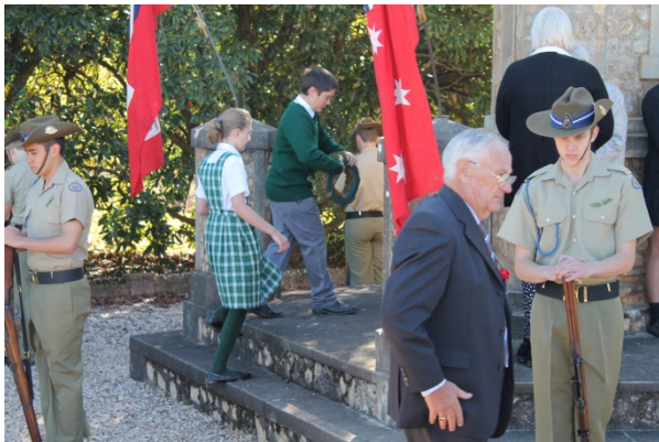
ANZAC Day 2013.

Our students are complimented on their outstanding behaviour and conduct every time they leave the school and also when visitors are present. The strong welfare and discipline policy at our school provides all students with a safe and positive working environment that clearly reflects the community's expectations.