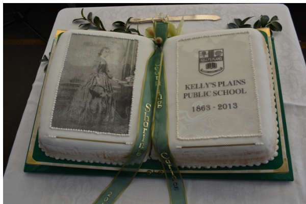
The Sesquicentenary cake.

This year the main focus for the P&C was the organisation of the school's Sesquicentenary (150 th ) celebrations which were held on October 25/26. Many people were involved in the planning, organisation and running of this special event.