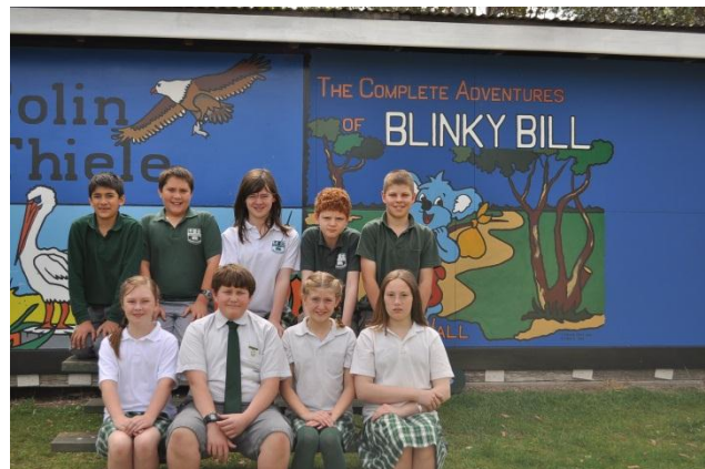
Years 5 and 6