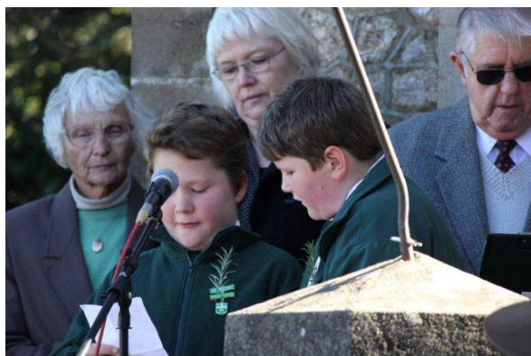
Anzac Day 2012

Our students are complimented on their outstanding behaviour and conduct every time they leave the school. The strong welfare and discipline policy at our school provides all students with a safe and positive working environment that clearly reflects the community's expectations.